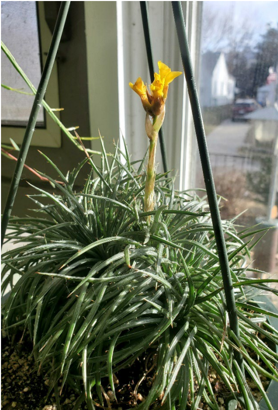
Dyckia choristaminea , a dwarf species from Brazil that forms a beautiful clump.