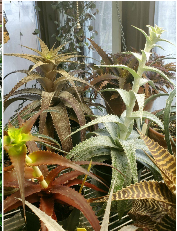
A fantastically well grown group of Orthophytums!