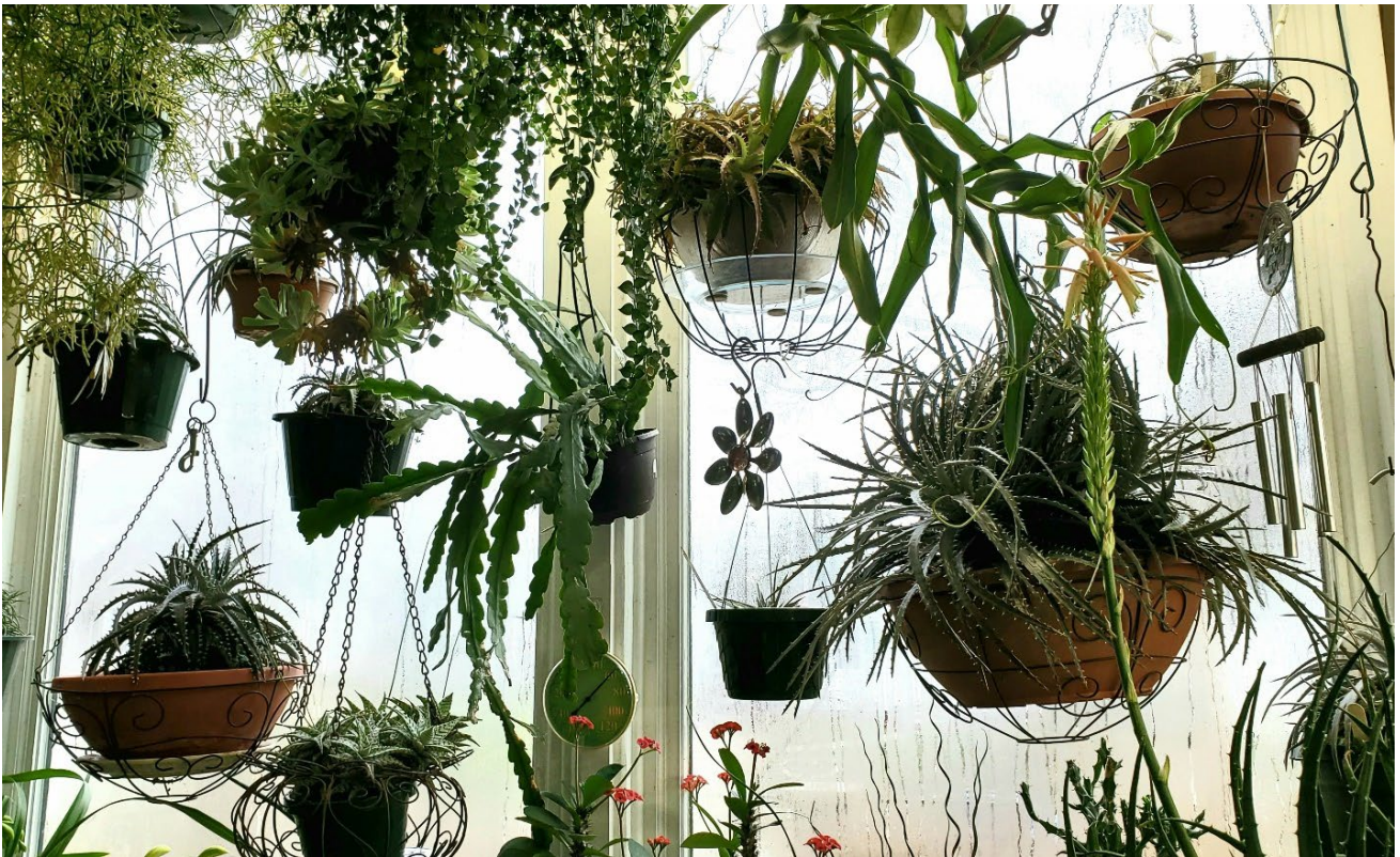
Inside the solarium! Dyckias , epiphytic cacti, Aloes, Euphorbias, and other assorted succulents take full advantage of vertical space!